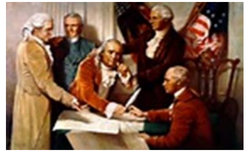
Signing of the U.S. Constitution Sept. 17, 1787