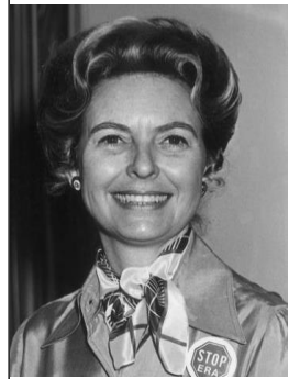
Phyllis Schlafly in 1972 with a Stop ERA button on her jacket.

History of the ERA: The Equal Rights Amendment was passed by the house in 1972 and by the Senate in 1973, and then sent out to the states for ratification. It was immediately adopted by 30 states, then slowly by 5 more states, but it needed 38 states to become an amendment to the Constitution. Even though Congress extended the deadline for another 3 years, they could never get the last 3 states. It was ruled null and void in 1982.