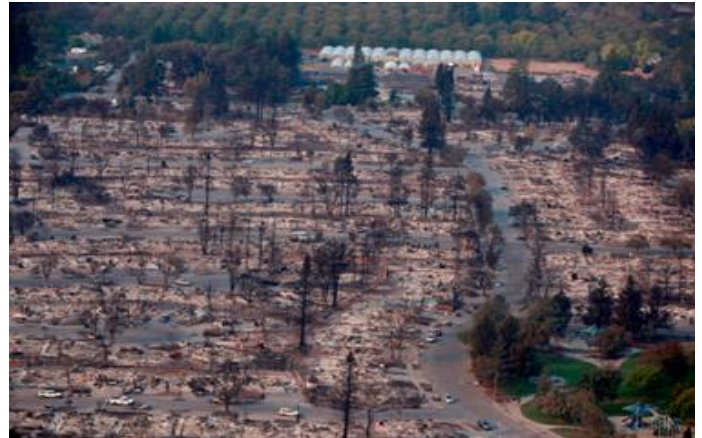
Coffey Park, Santa Rosa, where 1300 homes were totally destroyed down to their foundations during the wild fires of Oct. 8, 2017

"Build Baby Build" - But "a Different Type of Building" is Wanted - Roadblocks seem to be everywhere else. The following is an update on the Santa Rosa Fires - 8 months later: