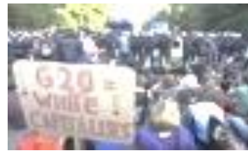
Rioting in Hamburg against Capitalists” at the Annual G20 Summit - Joined by NY Mayor de Blasio

Canada, Mexico, and countless other countries hold fair elections with the “burdensome” requirement of showing identification. The UK and the USA are the only Western countries who do not require ID at elections. And guess what two countries have the most voter fraud? You guessed it. Other countries are shocked that such modern, progressive countries hold elections not requiring any ID by the voters.